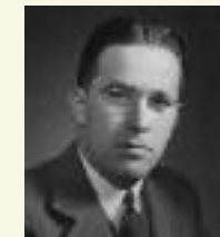
Representative Henry M. Jackson at the beginning of his 43-year career in the U.S. Congress.

Jackson’s interest in foreign affairs and national security threats also guided major legislative initiatives during the Cold War era. He co-authored the Jackson-Vanik Amendment to the 1974 Trade Act, which placed trade restrictions on countries that did not employ free emigration rights or market economies. He was a proponent of a strong national defense system and the containment of communism throughout his career and during the Vietnam conflict and the Cold War.